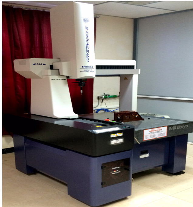
CNC-Coordinate Measuring Machine